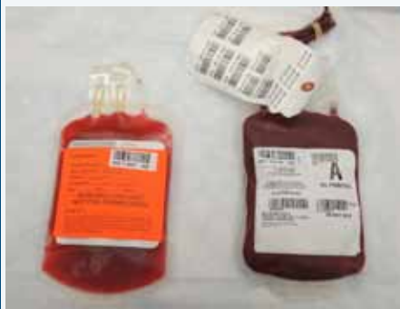
The NIH Blood Bank collects blood for research (left) as well as for transfusion into Clinical Center patients.