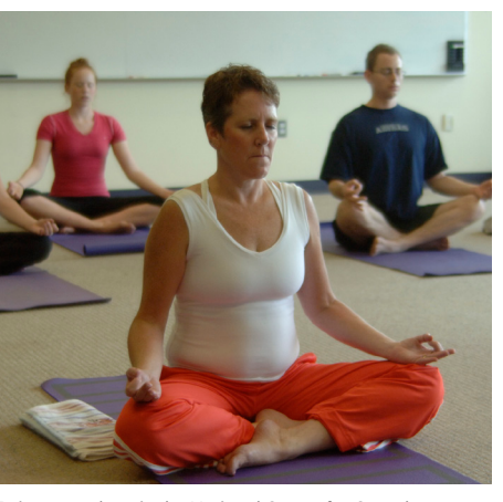
Pain researchers in the National Center for Complementary and Alternative Medicine have found that not only do yoga practitioners tolerate pain more than twice as long as individually matched control subjects, but they also have more gray matter in multiple brain regions.

From the 2014 Research Festival session "Epidemiology of Aging," co-chaired by Francesca Macchiarini (NIAID) and Evan Hadley (NIA) and held on September 22, 2014.