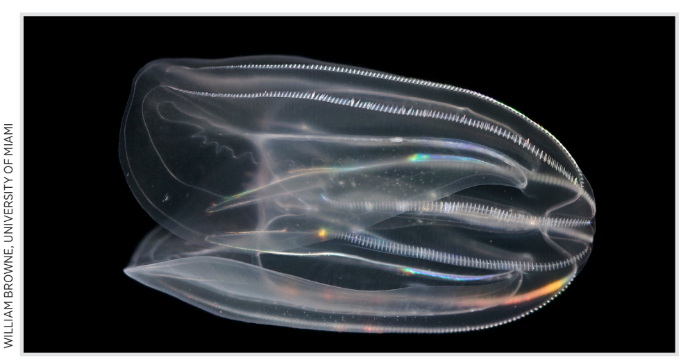
Comb jellies, like this Mnemiopsis leidyi , may have evolved more than 500 million years ago, but today they are providing clues to NHGRI scientists as to how sight developed in other creatures, including humans.