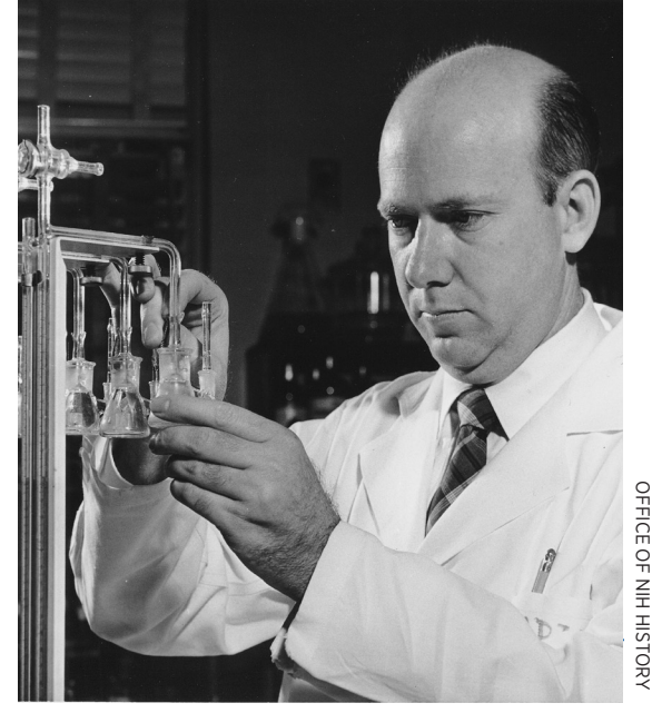
The NIH-wide recruiting program for intramural scientists was named for legendary NIH investigator Earl Stadtman (shown above in 1952) who died in 2008.

Ordinarily, searches for intramural scientists are conducted by individual institutes and centers (ICs). The Stadtman program, however,