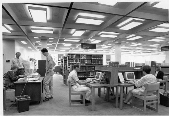
The NIH Library's reading room before Suzanne Grefsheim arrived in 1992 (above), was not as inviting and sun-filled as it is today (below).

I spent the first five years changing the mindset about the kinds of services we could provide. The next five years we tried to change the way the staff itself worked. We had to be more nimble, willing to take on new responsibilities and roles, and not be stuck in the traditional "wait till people come to you" mindset. If we were pushing out all our resources to users' desktops, we had to figure out a way to reach them. This whole period of learning and growing and staff development led to and culminated in the informationist program, which is now blossoming.