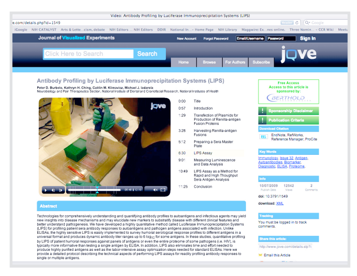
Researchers can learn to profile antibodies using the LIPS technique by watching a video at http://www.jove.com/details.php?id=1549.

The sensitivity of the LIPS technique is three or more orders of magnitude greater than the traditional technique, enzymelinked immunosorbent assay (ELISA). One reason is that, with LIPS, antigens maintain more of their three-dimensional shape as