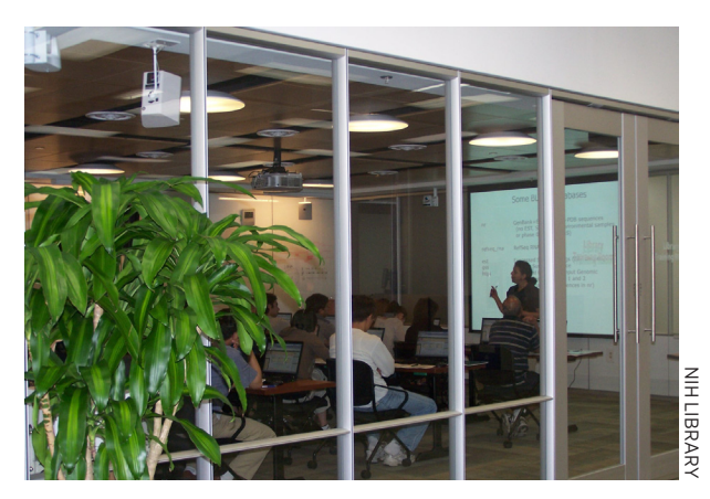
Many of the library's training programs are held in attractive glassed-in rooms like this one (above). Outside, library patrons can read, relax, and even compute on the terrace (below).

You have to be thinking 10 years ahead. A lot of libraries aren't. If they think that the library is the books and the journals and the place, and that