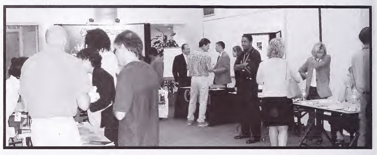
The NIH Job Fair, beld on September 30 during the Research Festival, featured 43 exhibitors who filled five conference rooms in the Natcher Building. The fair was well attended. Many employers had a constant stream of visitors and after only a couple of hours, some had already run out of literature to distribute. The exhibitors ranged from multinational corporations to small local biotechnology companies and included a few representatives of alternative careers outside the traditional academic and industrial research spheres. Nearly all of the exhibitors had open positions and some conducted on-the-spot interviews.