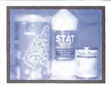
Higb-Calorie Mouse Jell-O -2 cups bolling water -1 pkg. raspberry-flavor Jell-O -60 mLStat-VME (VRP Pharmacy) -20 mLPediasure (VRP Pharmacy) -2 scoops Designer Protein (GNC Health Food Store) Blend well and refrigerate in icecube trays. Serve one-quarter cube per mouse per day.

Disclaimer: Mention of specific products in this article does not constitute an endorsement of those products, nor does it signify that other similar products are less desirable.